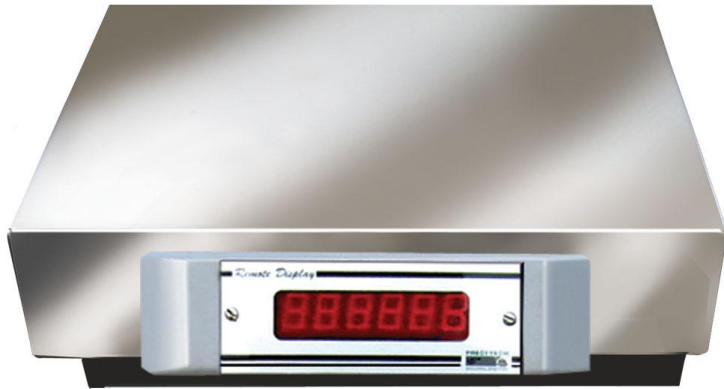
Table Top Model